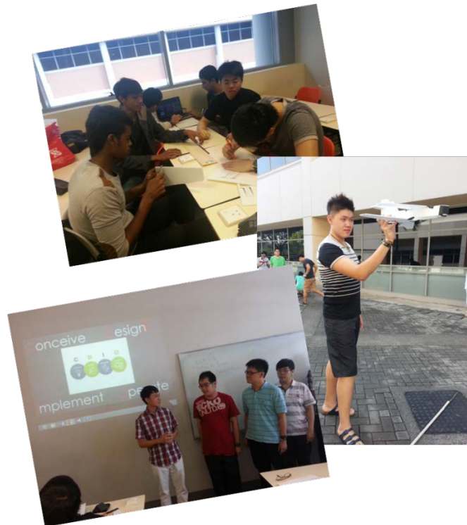
Figure 3. Glider Project

In addition to the competition, each group of students prepared an after-competition presentation, with every member sharing their roles, challenges faced and how their design was conceived and improved on. The learning experience through this glider project has enabled the students to learn through self-discoveries and failures in a safe environment.