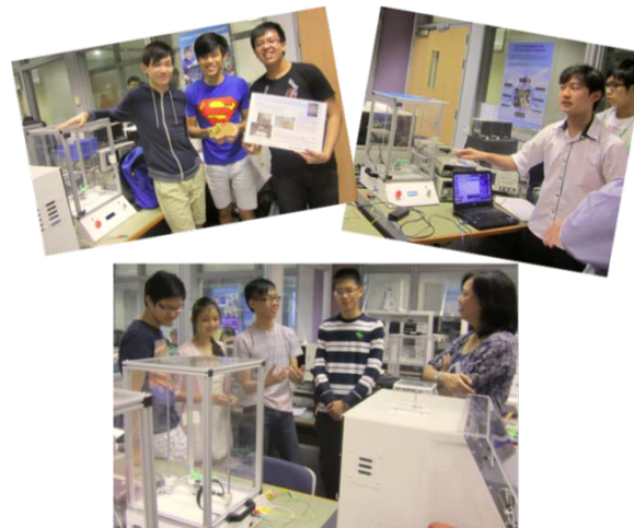
Figure 2. Flying Machine Project

Most of the students commented that they enjoyed the learning activities and the module did stimulate their interest to learn more about Aerospace Systems.