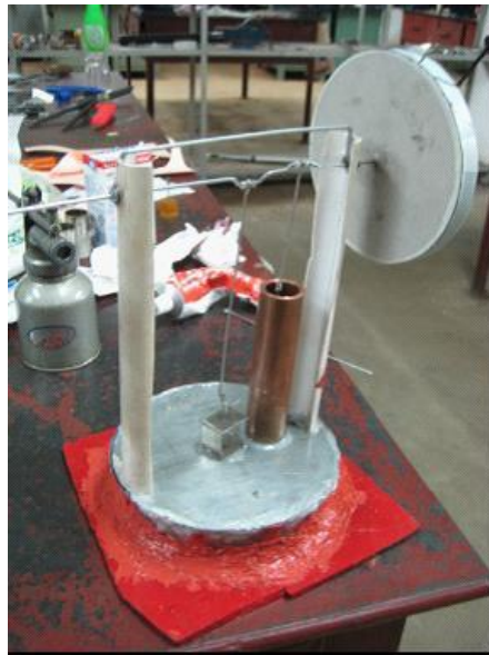
Figure 1. Picture of Student-Built Stirling Engine

Given that a design solution was already presented in the step-by-step website instructions, it was anticipated that the design-build exercise would be weak on the Conceive-Design elements but strong on the Implement-Operate elements. To the pleasant surprise of the project organizers, many of the student teams used the Instructables design as a starting point rather than a final design solution. Student teams conceived a variety of improvements on the Instructables solution and performed multiple design-build-test iterations, making the project a full CDIO experience. Details of this will be given later in the paper. A picture of one of the Stirling engine models, taken from a group design report, is shown in Figure 1.