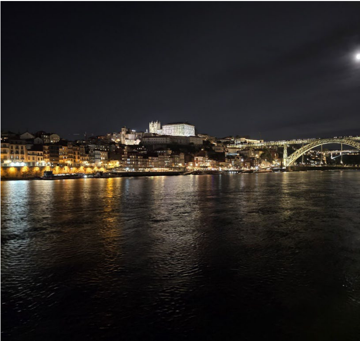
A very beautiful city and an excellent scenario for the meeting dinner