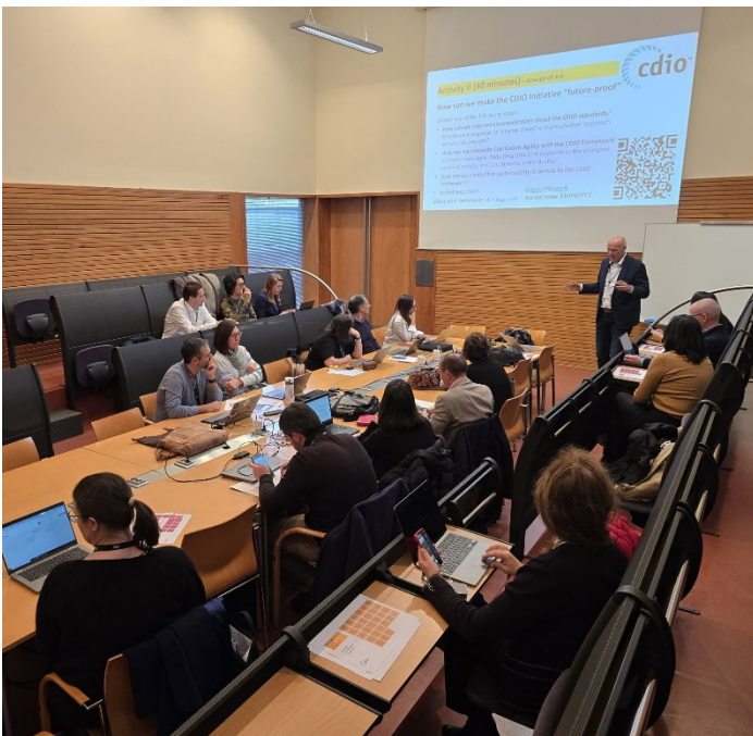
Workshop on the Future of CDIO