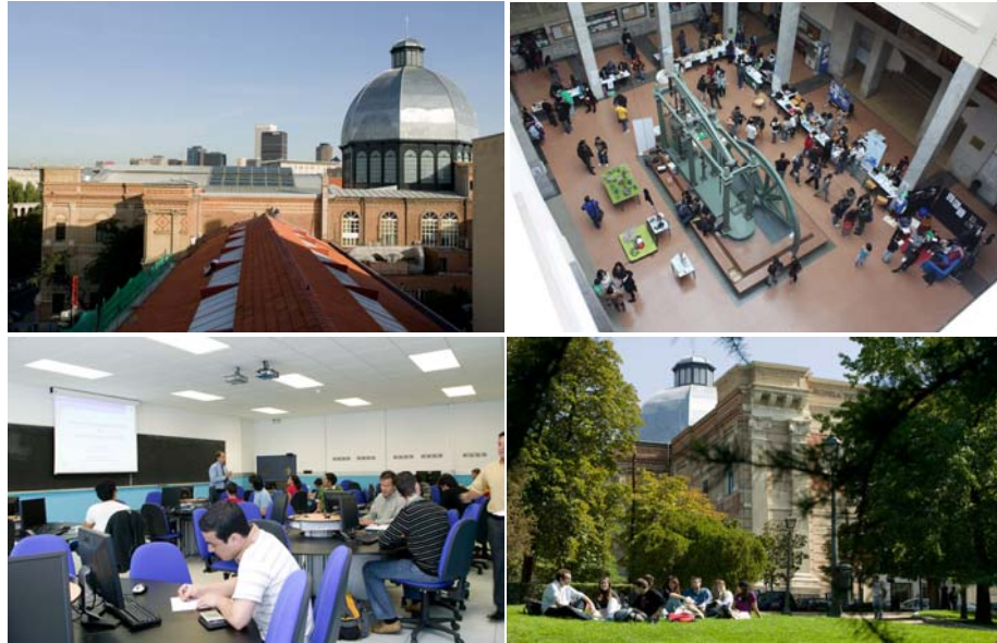
Figure 1. ETSII – TU Madrid Campus, main hall and collaborative learning environments.