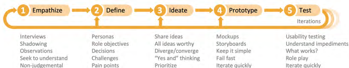
Figure 1: Phases and example methods of the design thinking framework

Design thinking is a framework that gives students and educators structure and tools to address problems with unknown solutions and wicked problems. The framework is a human-centered iterative problem-solving approach for developing innovative technologies, products, and services. The approach involves (a) identifying a problem and map and understand user needs, (b) developing concepts and proposals for solutions through creative development methods, sketches, and prototypes, (c) systematically testing the solutions on end users, and (d) improving the solution through iterations of the process. The framework, which exist in numerous variants and modifications and is usually explained through the five phases described in Figure 1.