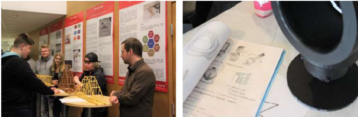
Figure 3. The first year's students, presenting spaghetti bridges (left) and a winning table ventilator solution by the adult student team (right).