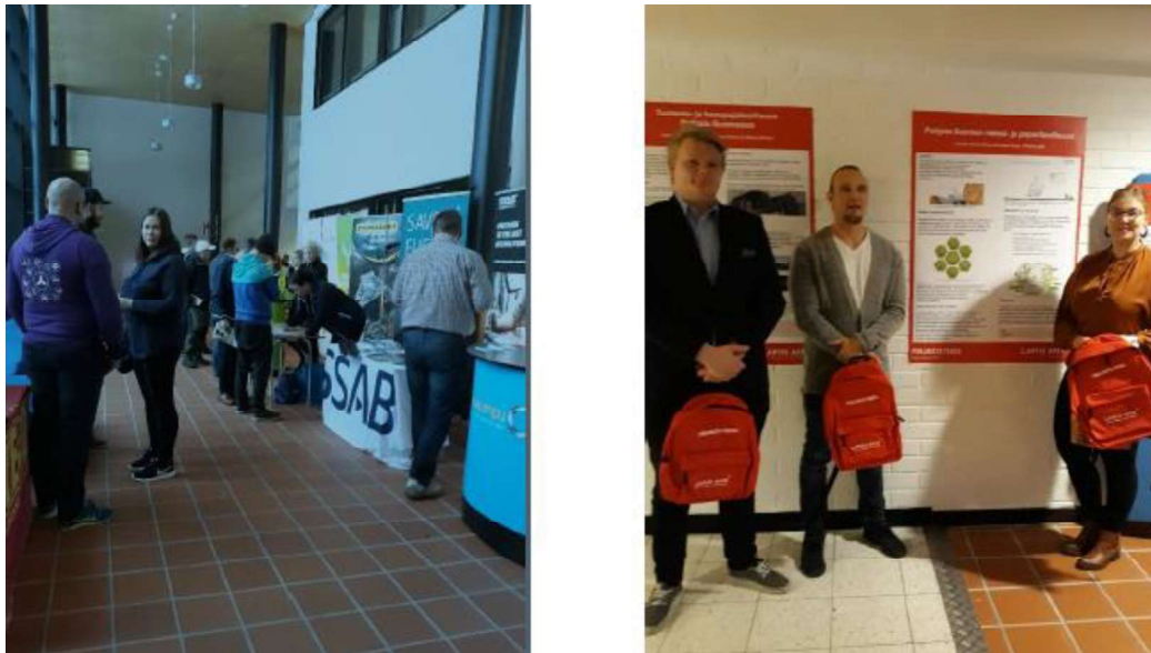
Figure 2. The company booths at the fair (left) and the winners of the student projects (right).

In the first academic year, the students practice basic subjects of Mechanical Engineering combined with natural science, language, and social skill studies. The field of Mechanical Engineering becomes familiar to the students. First year's autumn semester project is On the way to Becoming an Engineer in which the students are familiarized with different kinds of industries of the Lapland region. In this project, the students learn some basics of the circular economy ( phase C - Conceive ), and they study how this theme is shown in the mining, steel, paper, forest, energy and machine workshop industries ( phase D - Design ). The semester project culminates with a fair where the students introduce their semester project results ( phase I – Implement ), and the companies introduce activities and practical training possibilities for the students ( phase O - Operate ). The fair also contains competition for the teams. The participants of the fair can vote for the best poster and the best performance among the projects (Figure 2).